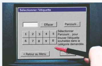
Select your sign number using the poster