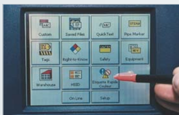
Choose the FlashSign icon