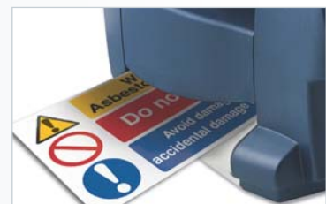
Print your sign